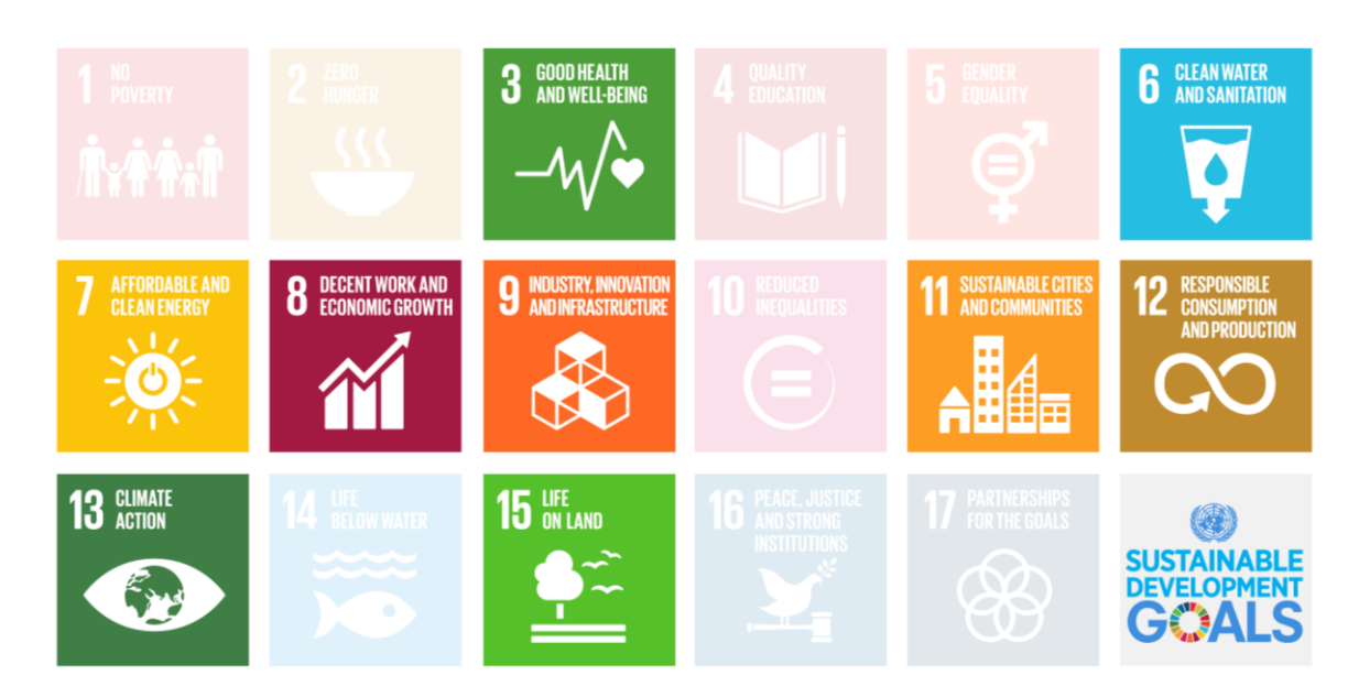
Figure 3 – Ghelamco SDG contribution

As real estate is a key sector in the transition to a sustainable and low-carbon economy, Ghelamco is committed to contribute to the United Nations' Sustainable Development Goals (SDGs). Given its consistent and ongoing focus on developing sustainable and energy efficient projects which add value to local communities, Ghelamco contributes to the following SDGs: #3 Good Health and Well Being, #6 Clean Water & Sanitation, #7 Affordable and Clean Energy, #8 Decent Work and Economic Growth, #9 Industry, Innovation and Infrastructure, #11 Sustainable Cities and Communities, #12 Responsible Consumption and Production, #13 Climate Action, and #15 Life on Land (as highlighted in figure 3 below).